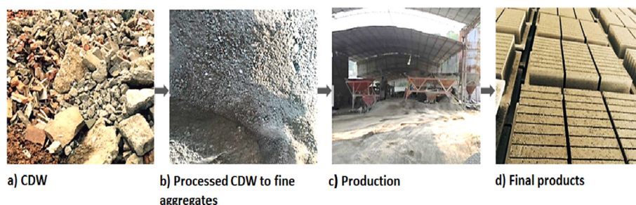
Fig. 1. Workflow of masonry brick production from processed C&DW in China (Jin et al., 2017).

The questionnaire was specifically designed to investigate perceptions of the UK construction sector's key stakeholders of C&DW on two main issues: i) the bottlenecks in C&DW management and,